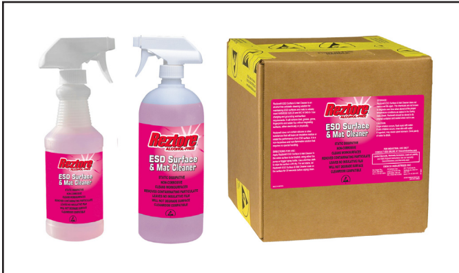
Figure 1. Reztore® Alcohol-Free ESD Surface & Mat Cleaner: 16 Ounces (500 mL) Spray Bottle 1 Quart (1 liter) Spray Bottle 2.5 Gallons (10 liters) Bag-in-Box