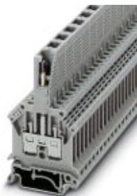
Component connector, pitch: 6 mm, number of positions: 1, color: gray

Please be informed that the data shown in this PDF Document is generated from our Online Catalog. Please find the complete data in the user's documentation. Our General Terms of Use for Downloads are valid ( http://phoenixcontact.com/download )