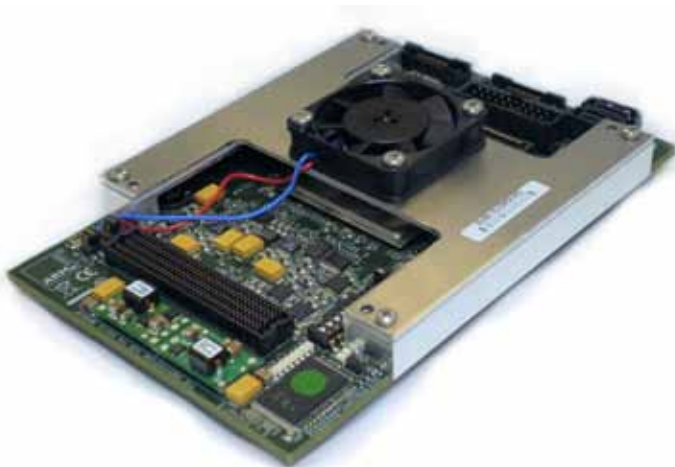
LogicTile Express 3MG with ARM Cortex-R5 SMM

The implementation uses standard ARM CoreLink™ System IP components to implement a basic SoC design to mimic the test chip developments of our CoreTile Express products.